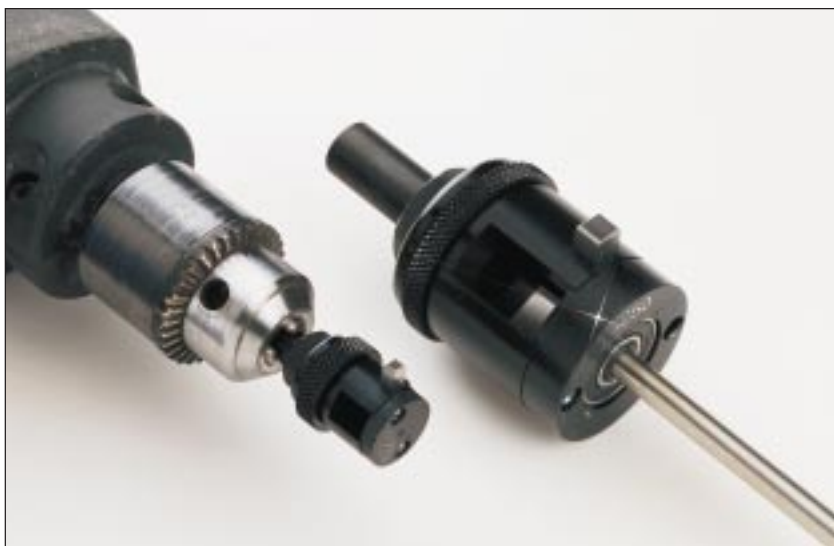
Thermocouple Wire Stripper for OMEGA CLAD® wire. See PST Series Strippers in Section H.